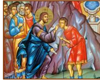
The Blind Man